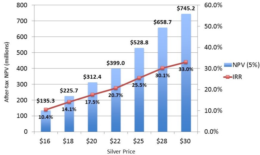
Figure 1. After tax NPV and IRR of Silver Bull's PEA with a changing silver price. The price of zinc remains fixed at $0.95USD lb. As contemplated by the PEA the Sierra Mojada would produce an average of 5.5Moz of silver and 65Mlbs of zinc per year

Lastly we continue to be very encouraged by the exploration upside in the wider region. Two zones, "Palamos Negros" and "Dormidos" – both historic mining areas 9 kilometers along strike from the main Sierra Mojada deposit have a very similar style of mineralization to our main deposit and give a sense of the very large size of this mineralizing system. Both these targets have never been drilled and depending on improving market conditions, are planned to be the focus of our next exploration drill program.